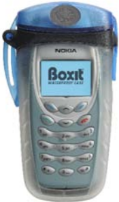
Boxit 5.1 Aqua Small

Boxit 5.1 Small includes the case, small lid, versatile clip, plastic spring and support pad.