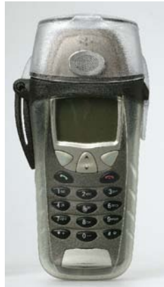
Boxit 5.1 Crystal Tall