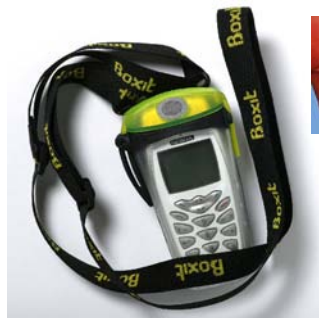
905140 Neck Strap