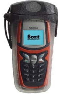
Boxit 5.1 Black Small

Boxit 5.1 Tall includes the case, tall lid, antenna extension, Hands Free plug, versatile clip, plastic spring and support pad.