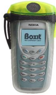
Boxit 5.1 Citron Small