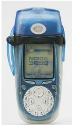
Boxit 5.1 Aqua Tall

Boxit 5.1 Tall includes the case, tall lid, antenna extension, Hands Free plug, versatile clip, plastic spring and support pad.