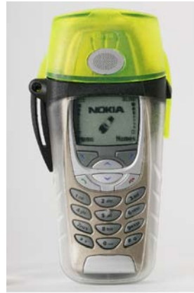
Boxit 5.1 Citron Tall