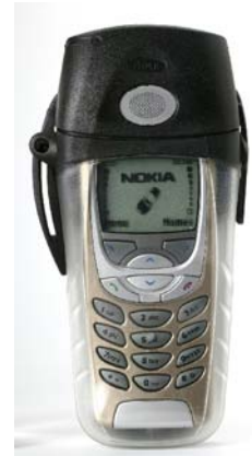
Boxit 5.1 Black Tall

Boxit 5.0 Universal – Includes the case, tall lid & small lid, antenna extension, Hands Free plug, versatile clip, plastic spring and support pad.