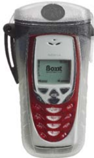
Boxit 5.1 Crystal Small